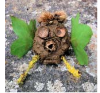
Caroline's quirky creature

Use the mud like clay to form the body of your creature. You'll need some sloppy mud you can mould into shape. If you can't find any muddy puddles, add some water to earth from a molehill or the soil from the woodland floor.