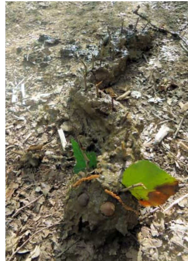
Sally's slippery slithery serpent

Look out for natural materials to create wings, legs, tentacles, claws, spines, scales, feathers and eyes.